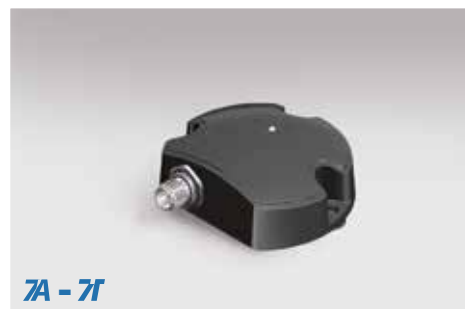
7A - 7T