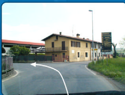
E Turn left at the crossroads.