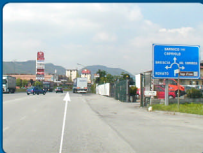
B Drive about 300 mt.