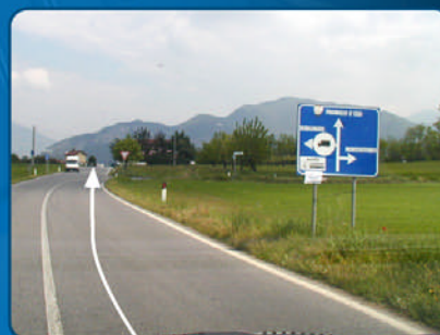
F Continue about 1400 mt, following the signs for "Provaglio d'Iseo".