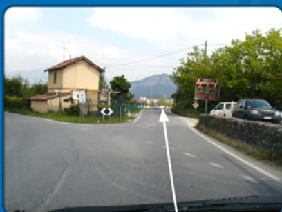
G Bear right at the crossroads.