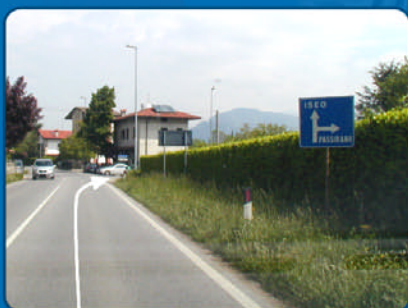
D Turn right just after the sign indicating "Passirano" and continue about 1400 mt.