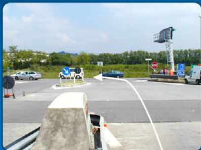
A Exit at Rovato and turn left (keep to the right-hand side of the road).