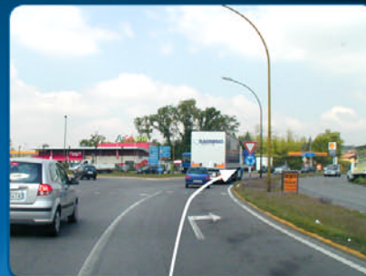
C At the roundabout, take the first right-hand turn towards Iseo and continue for about 4 km.